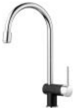
BLANCO RITA DUAL SPRAY