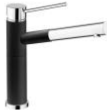
BLANCO ALTA DUAL SPRAY